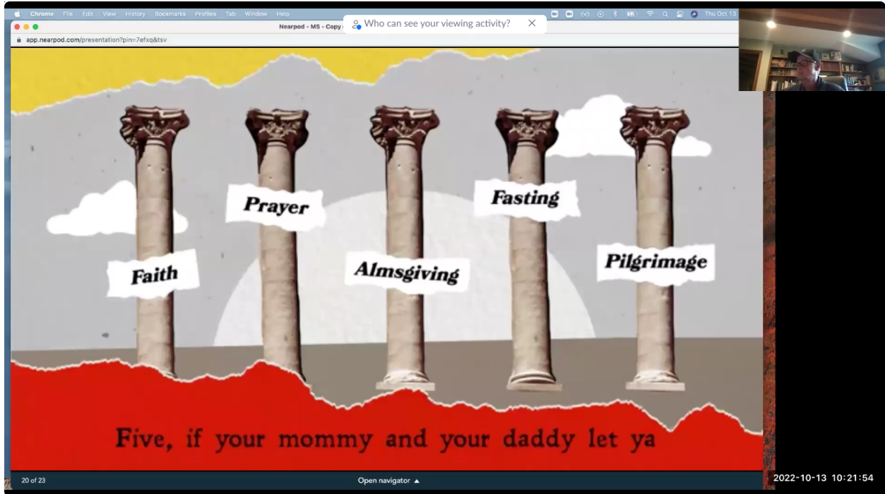
5 pillars of Islam