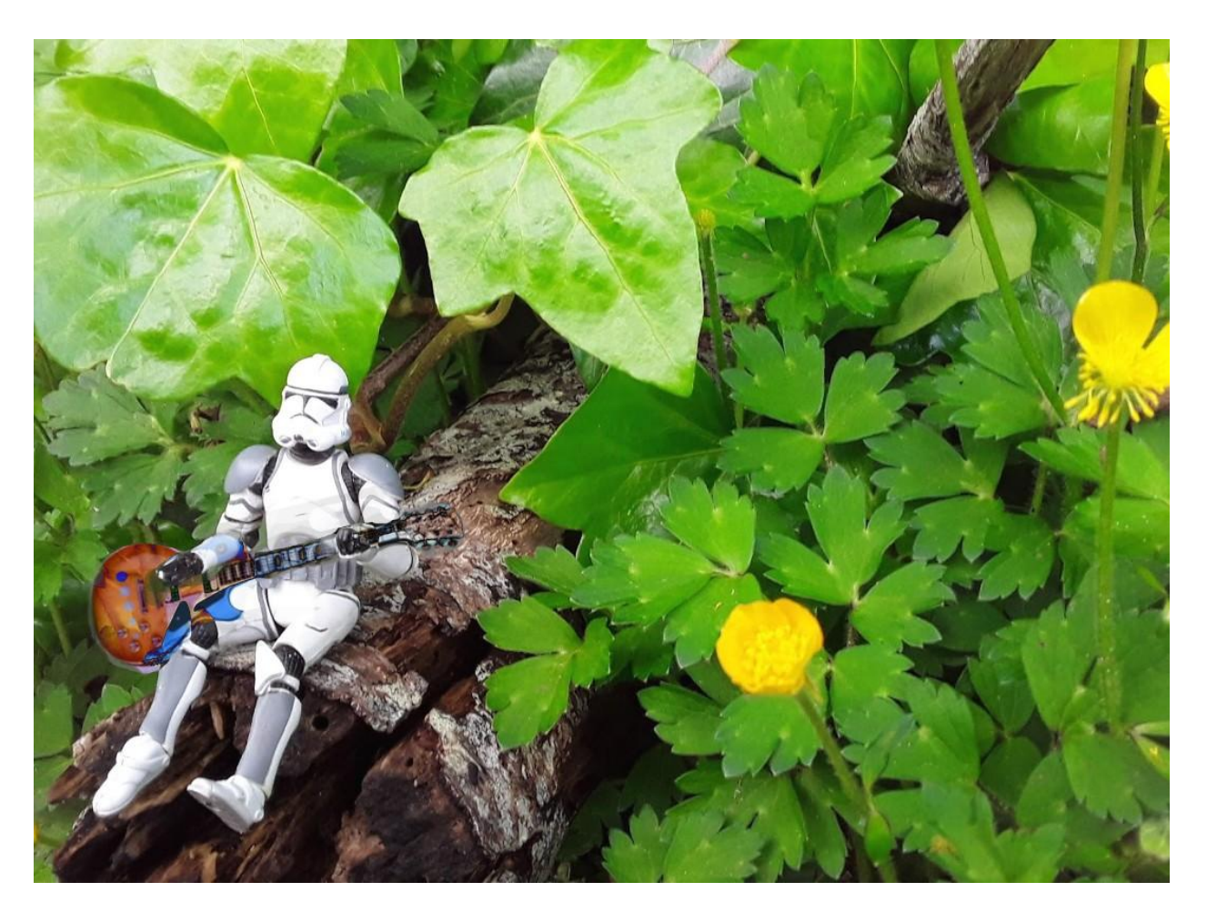
The softer side of Storm Troopers